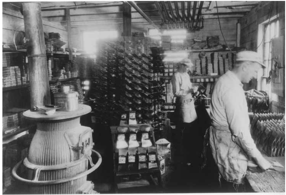
Workers inside the Spiller Ax Company.