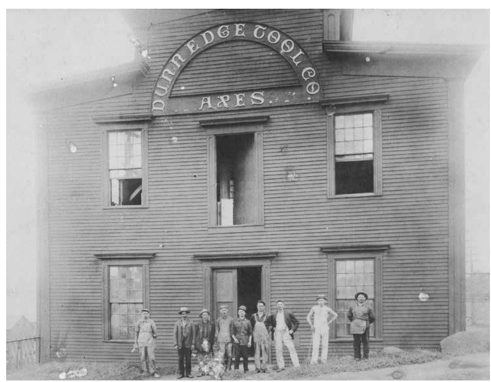
Workers stand in front of the entrance to the Dunn EdgeTool Co., circa 1900.